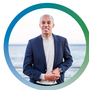
Stéphane Diagana World Champion Champion for Peace